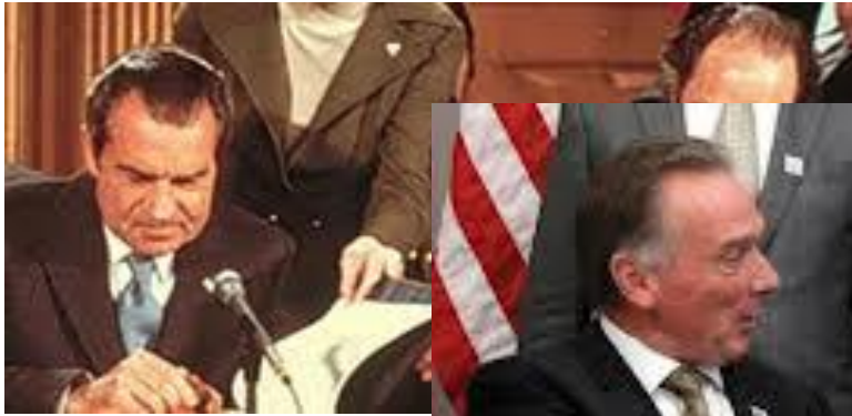
President Nixon Minister Trudeau,