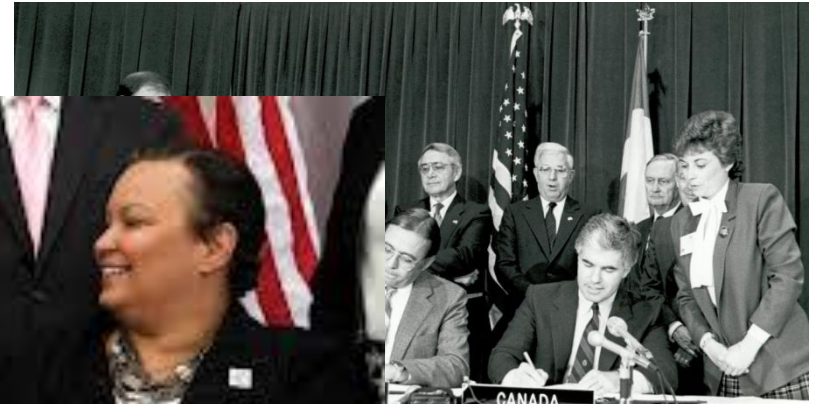
Canada Minister and U.S. EPA Administrator November 1987