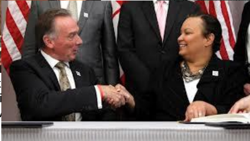
Environment Canada Minister Peter Kent and U.S. EPA Administrator Lisa Jackson, September 2012