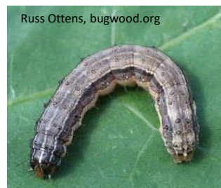
Russ Ottens, bugwood.org

Spongy moth, Lymantria dispar Hosts: Oak, maple, beech, willow, apple, plum Not present/established in AB, SK, MB CFIA REGULATED